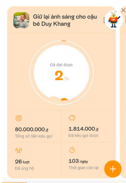
Fundraising campaigns on online platforms: Give.Now, Give.Asia, and the ThienNguyen App