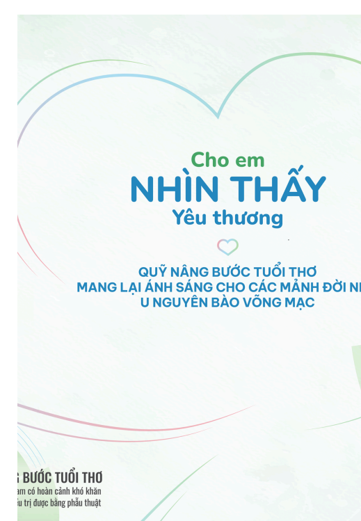
“Lighting Up Our World With Love” A Campaign for Children with ROP and Retinoblastoma

We would like to express our gratitude to all, for your kind heart and contribution. Your silent support has been and will be your long-lasting and reliable support for us. We all know, good deeds always bring good results and we will bring happiness to the children’s future.